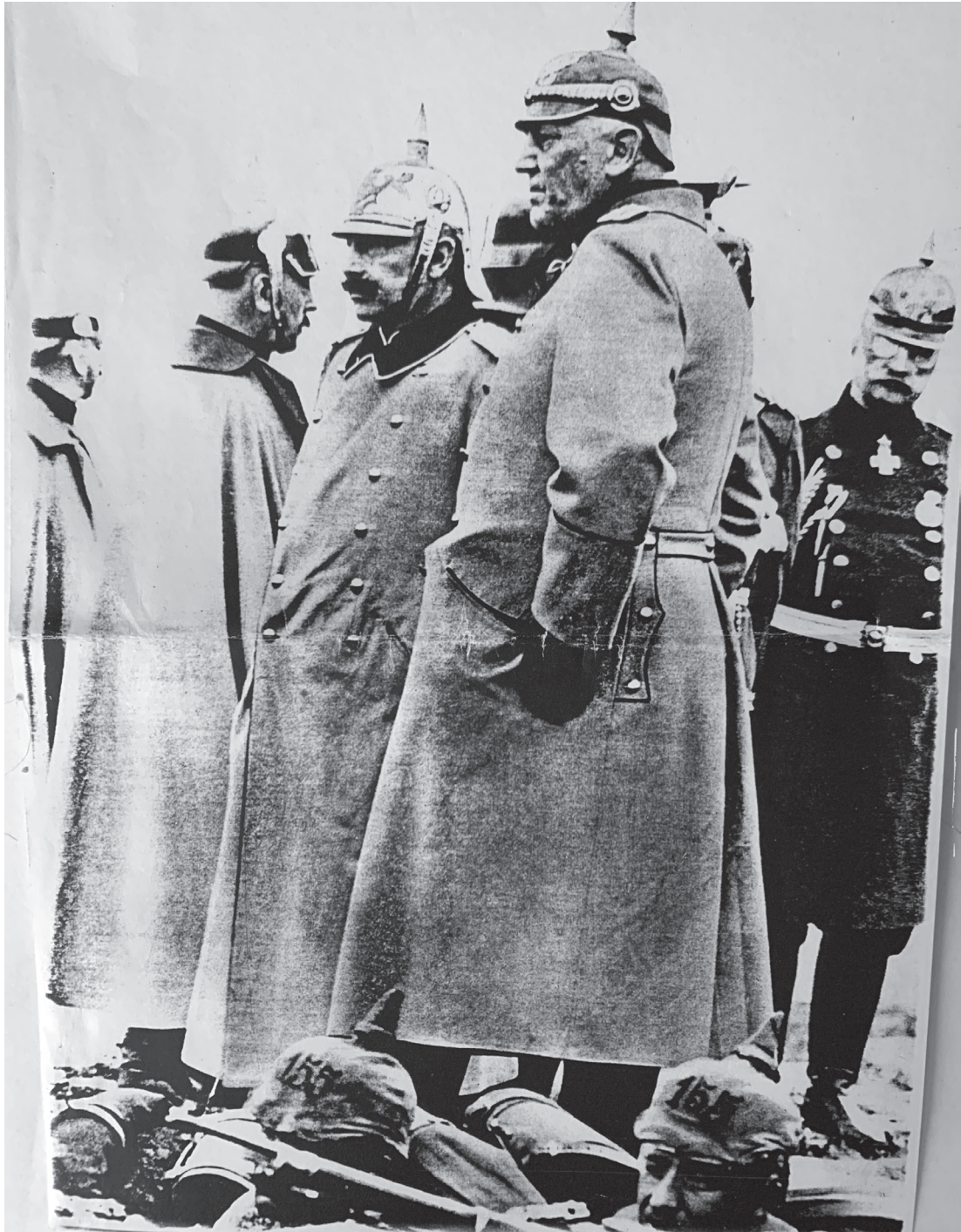
Photo 3: shows the Dark Empire Imperial General Staff on manoeuvres outside the legionary headquarters at Bigchester. The generals (Herpes and Howard the Frank) are seen here wearing their portable bivouac tarpaulins, for use only in the drizzle which is a permanent weather feature of the Belt of Occult.

Additional archive photos are now available.