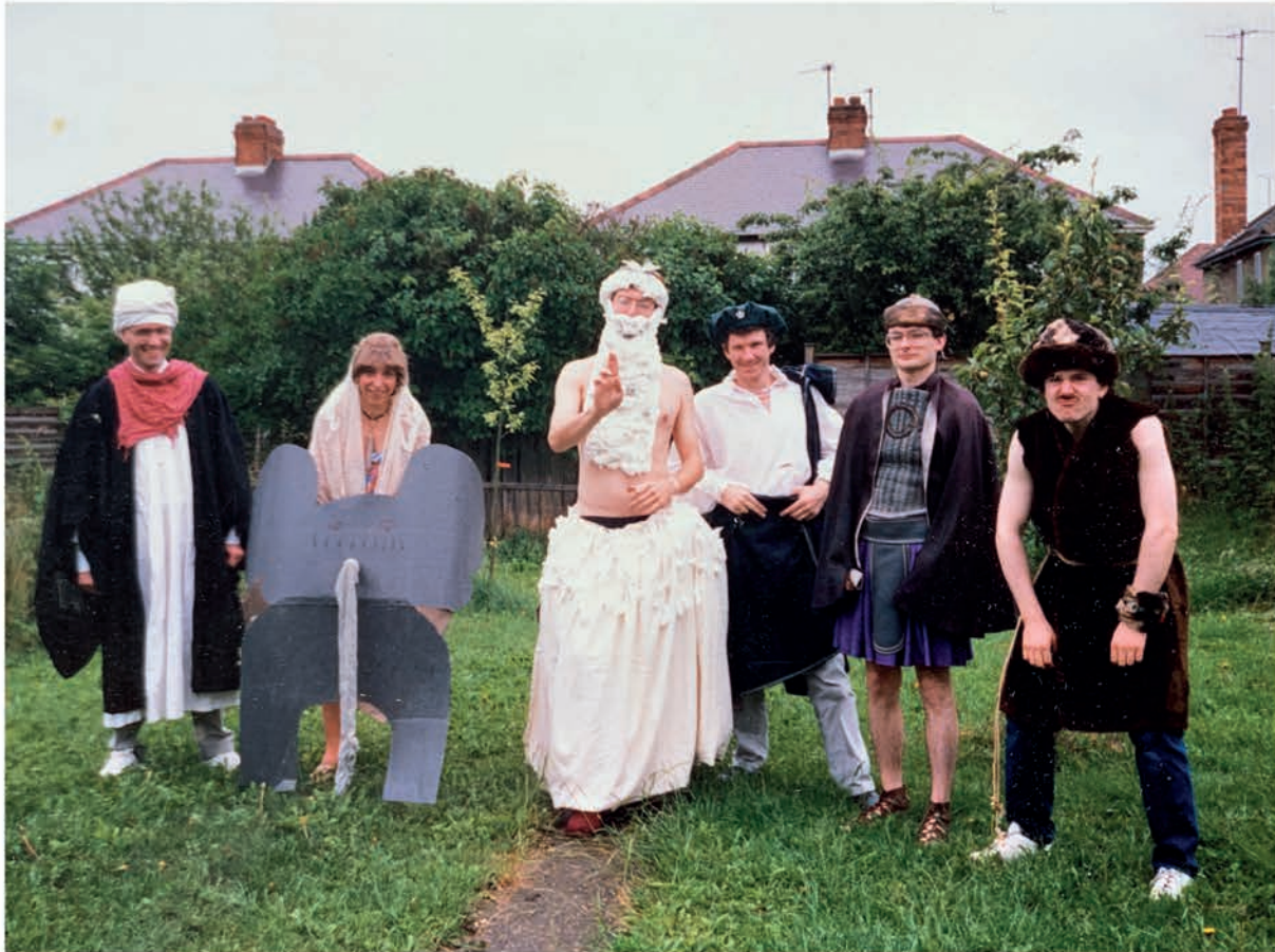
(Above: from Methuselah's first birthday party, June '88)

From left to right, The Ayatollah [then the lily white leader of the Serpian Empire - now a revered exponent of diplomacy], Empress Sophia of Indianus plus elephant, God [blessing all from the clouds], Boaconstrictia's cultural attache the late Belcher Three Buttock, Mad King Eric Seleucid [Trying to look studious], and an unidentified barbarian gate crasher - Rumored to be General Hinrich-Von-Fartenblaster of the Parbeerian Dominion. In the distance, the roof tops of Circumcizia (G4).